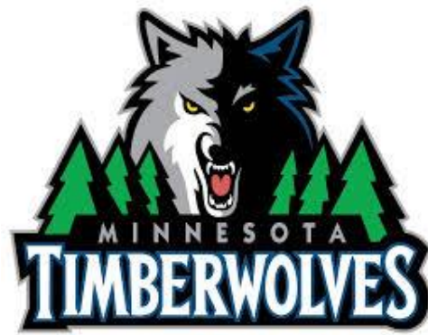
Logo for the NBA's Minnesota Timberwolves