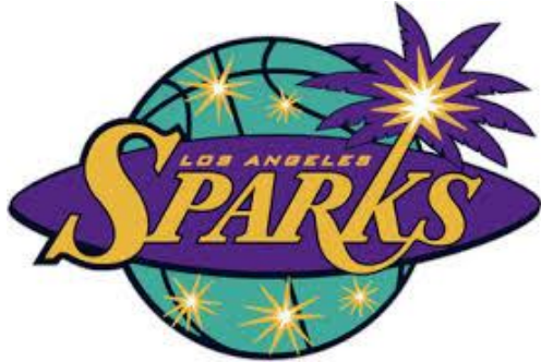
Logo for the WNBA's Los Angeles Sparks