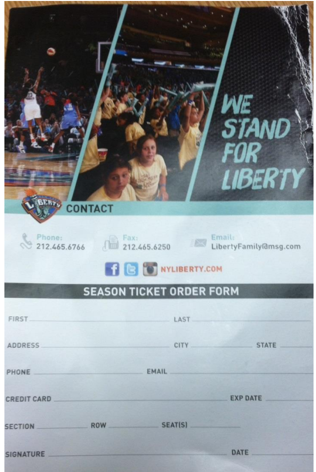
Figure 7: Liberty 2015 Season Ticket Pamphlet Back Cover