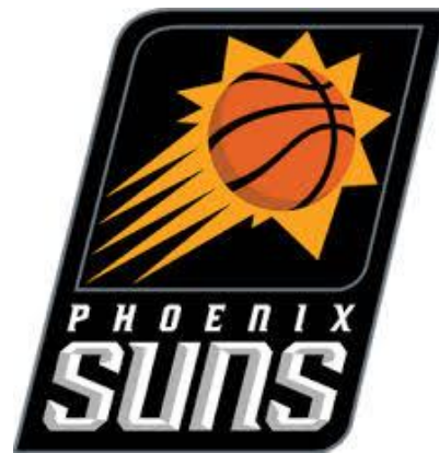
Logo for the NBA's Phoenix Suns