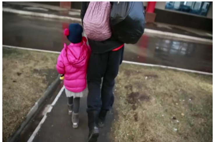
Figure 5: Candace Parker walking daughter to school