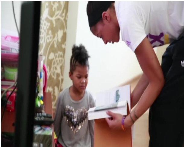
Figure 4: Candace Parker and daughter Image captured from "Watch Me" Commercial