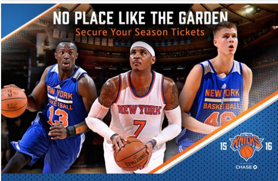
Figure 8: Knicks 2015-2016 Season Ticket Ad