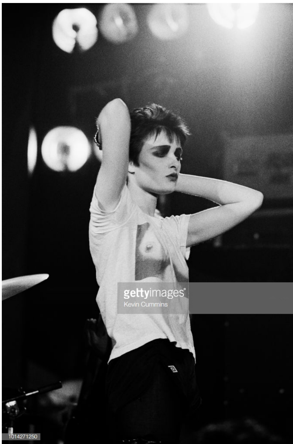
Siouxsie Sioux in Manchester 1977.