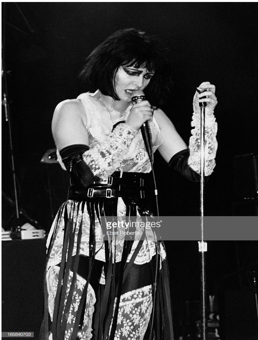
Siouxsie Sioux performing with Siouxsie and the Banshees, US, 1984.