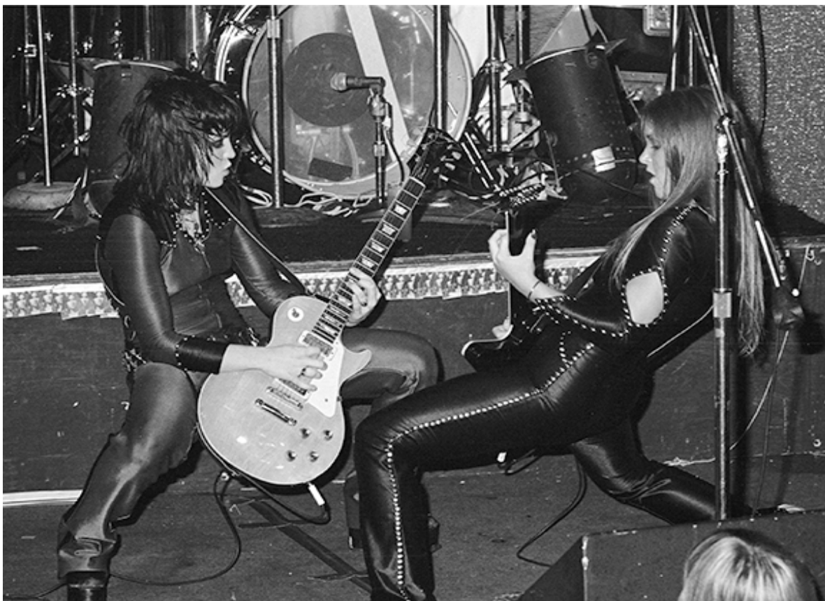
Joan Jett and Lita Ford performing with the Runaways.