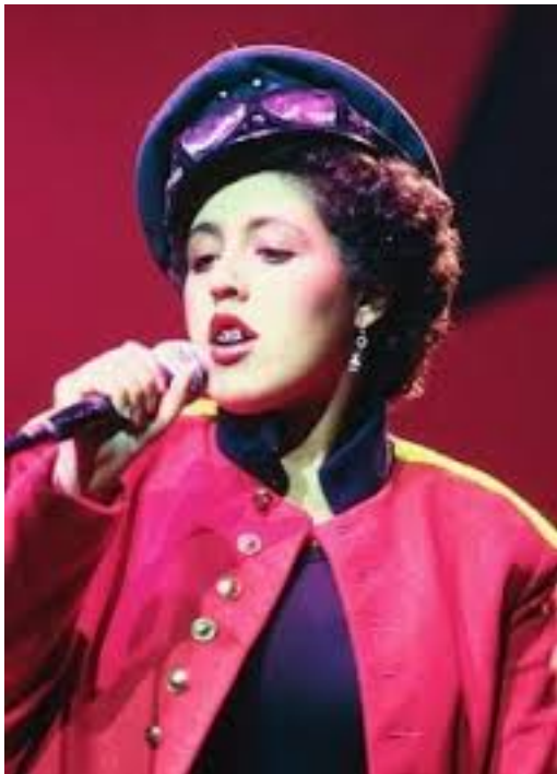
Poly Styrene (Photo Credit: Second Hand Songs).