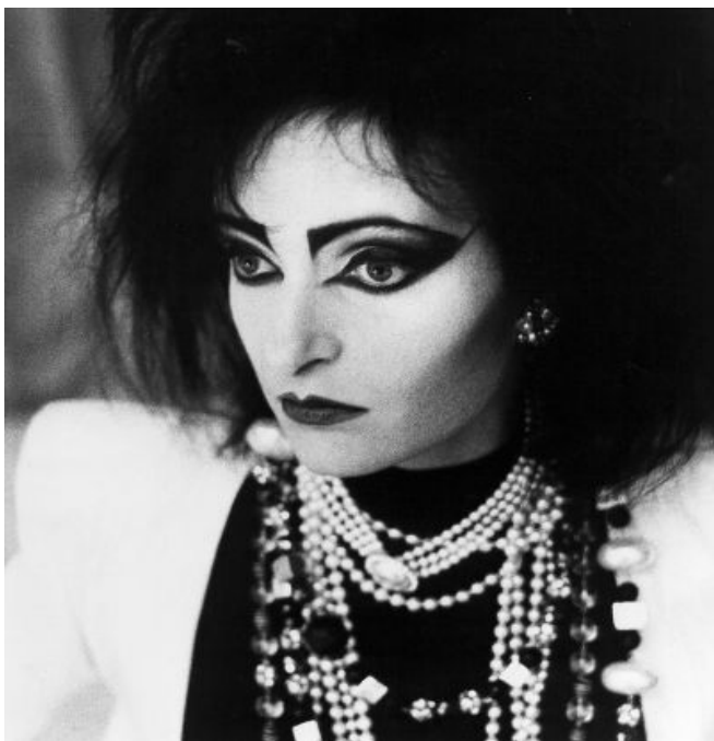
Siouxsie Sioux.