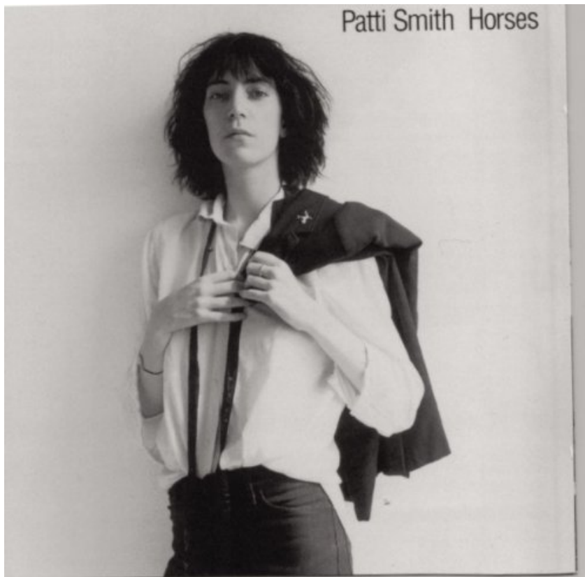
Patti Smith.