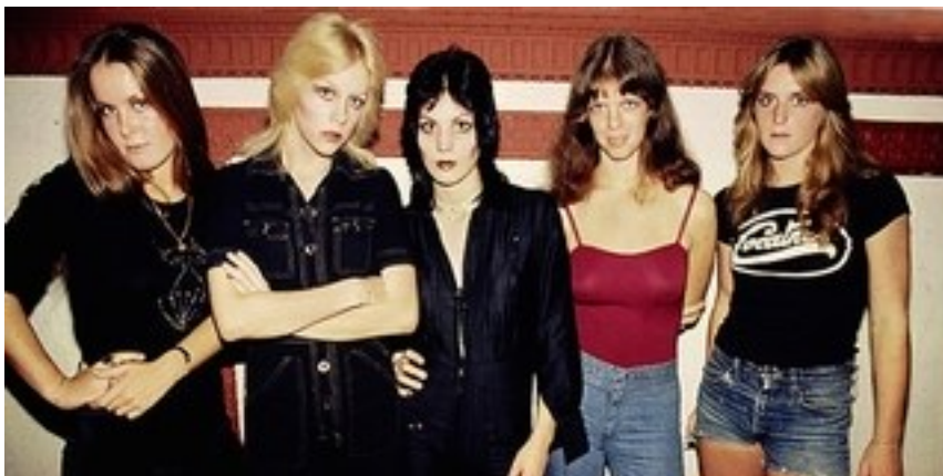
The Runaways (Photo Posted By Bryan Thomas on July 14, 2016, Nightflight.com nightflight.com/out-of-bounds-siouxie-the-banshees-memorable-cameo-in-a-mostly-forgotten-1986-action-thriller/ ).