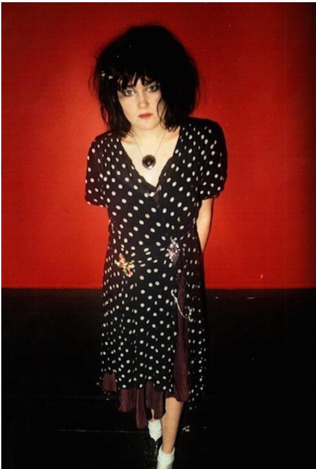
Exene Cervenka.