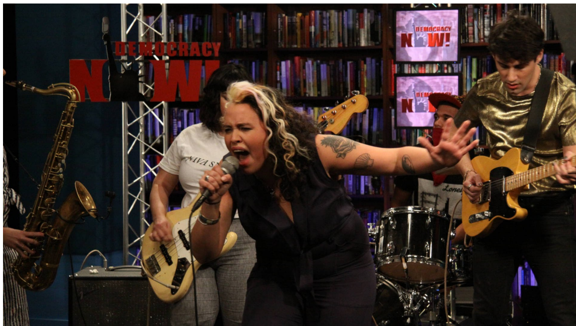
Downtown Boys.