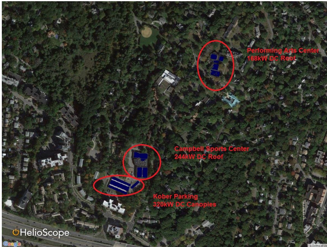
Figure 1 “SLC campus overview of potential solar roof space” (Borrego 2016).

The energy efficiency of the campus heating systems can be significantly increased by employing the services of the company Radiator Lab. This company customizes radiator covers to be placed over the existing radiators in old buildings. Installing these radiator covers would be particularly feasible and beneficial for Hill House, at a price point of $495 per cover. They would allow for each individual student to regulate the temperature within their room. The excess heat would be pumped back into the system and go towards rooms that are less insulated. This system would generate significant cost savings with a 1 year warranty and an average of savings of 34% per year on heating costs.